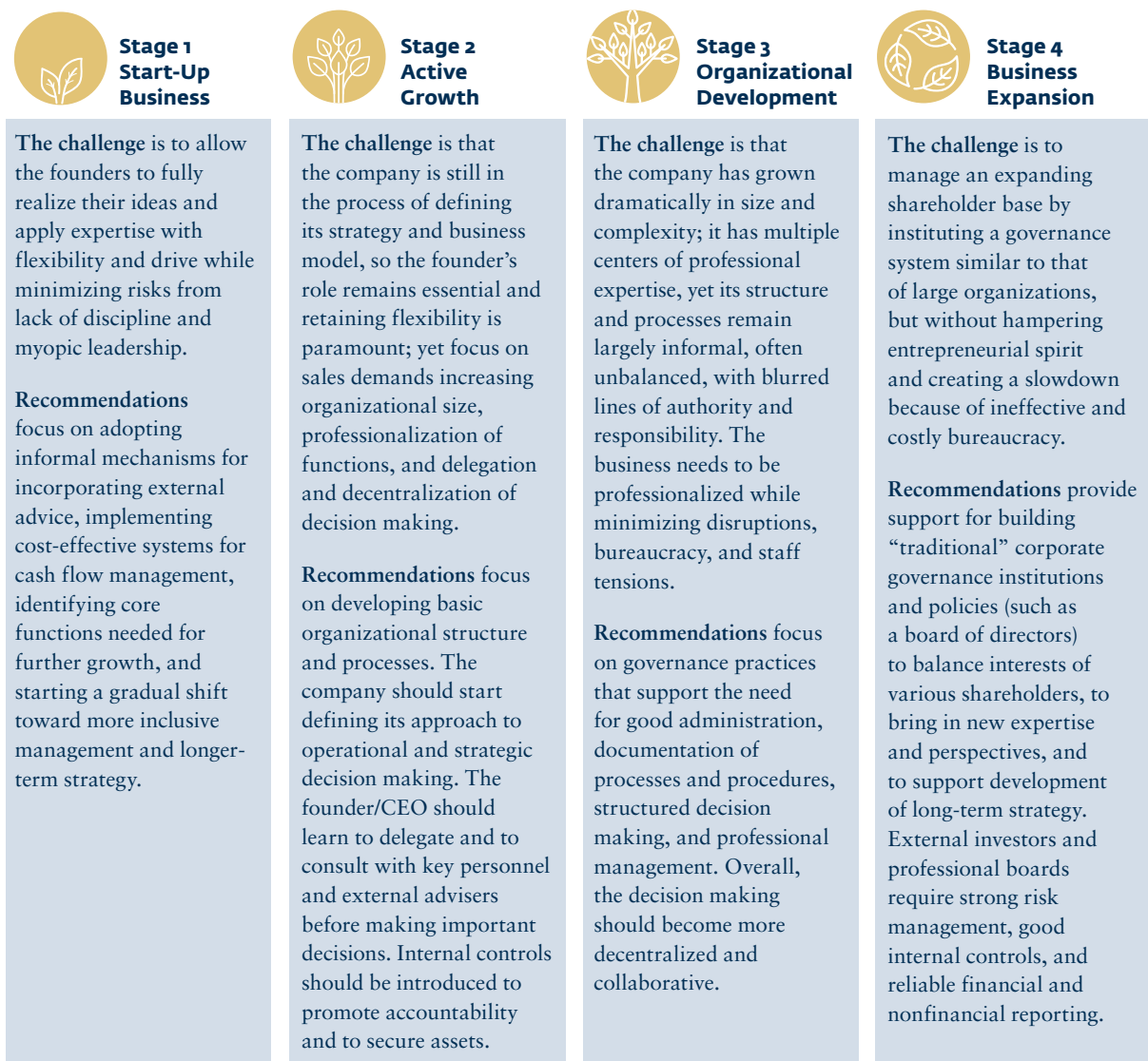
Table 2: The Four Stages of SME Evolution

Table 2 broadly summarizes typical challenges that are characteristic of each stage of development, and the overall focus of stage-specific governance recommendations that can benefit companies the most.