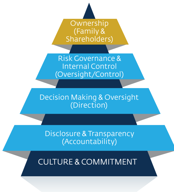
Figure 1: SME Governance Topics in Relation to the Organizational Governance Principles

Specifically, these topics aim to analyze the following: